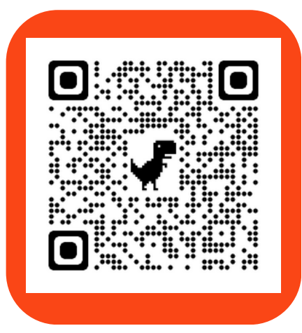
SCAN TO DONATE

Our Annual Banquet is coming up on September 28, and we are recruiting sponsors! Sponsorships serve as leveraged dollars to create a platform for vision sharing and generosity. As a Sponsor, you are investing in life transformation and community impact .