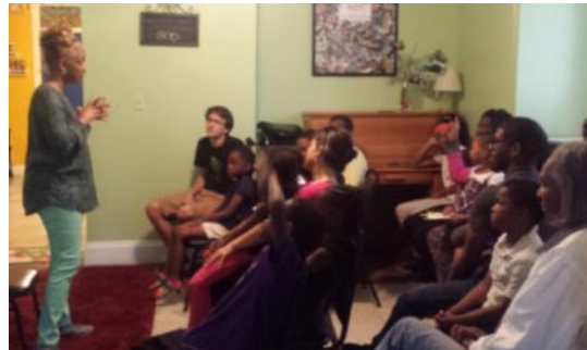
RTNI students learn about Jesus!