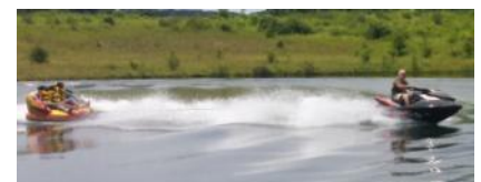
A day at the lake is worth 2 anywhere else...