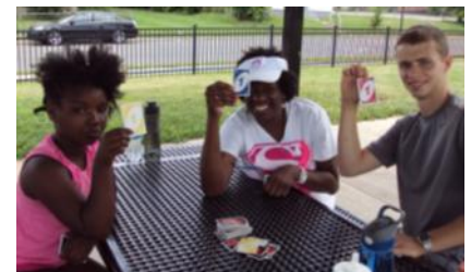
There are some serious UNO games at our Jesus Fun Days.