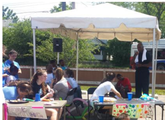
Thank you Columbus Fire Fighters for sharing about what you do, and showing students the truck.