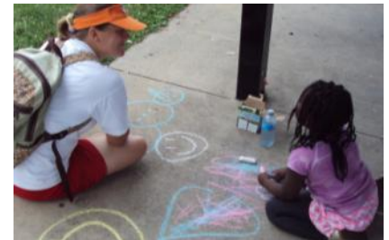
Our chalk art is...beautiful.